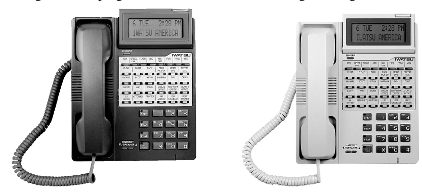
IX-12KTD-2 with IX-12ELK, black (not shown), gray (discontinued) and ash (discontinued)

The IX-12KTD-2 Digital Multiline Display Telephone offers all the functionality of the IX-12KTS-2 with the addition of a 2-line, 16 characters per line liquid crystal display and an incoming call indicator lamp. This display is very helpful for using advanced features and for providing status information. The oversized indicator lamp flashes red for incoming calls and green for a programmable feature such as message waiting.