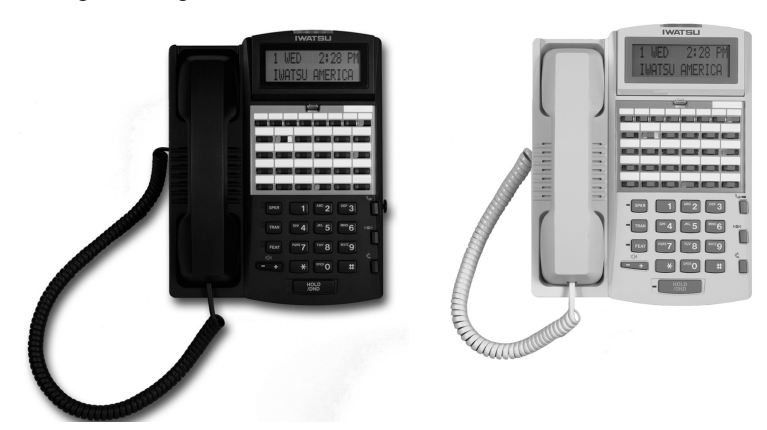
IX-12KTD-3 with IX-12ELK-3, black and white

The IX-12KTD-3 Digital Key Display Telephone offers all the functionality of the IX-12KTS-3 with the addition of a 2-line, 16 characters per line liquid crystal display. This display is very helpful for using advanced features and for providing status information. The IX-12KTD-3 Digital Key Telephone has an incoming call/message waiting indicator lamp that flashes red for incoming calls and green for a programmable feature such as message waiting. This model is available in black, or white.