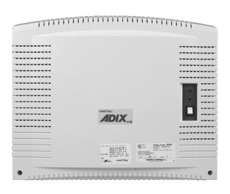
ADIX-VS Cabinet (VS-KSU)

PowerNominalMaximumVS-PWSU Input:167 watts240 watts