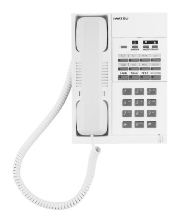
IX-MKT, black and white