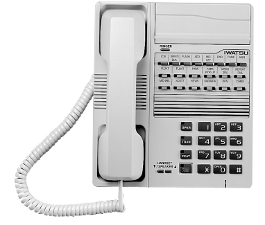
IX-12KTS-2, gray and ash