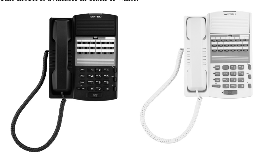
IX-12KTS-3 black and white

The IX-12KTS-3 Digital Key Telephone has 4 Fixed Feature Keys with a red LED, 8 Programmable Multi-Purpose Keys with a red LED, 12 Programmable Multipurpose Keys each with a red LED and a green LED, a mute key, a ringer volume control key, a handset volume control key, a speaker volume control and a full-duplex speakerphone. The IX-12KTS-3 Digital Key Telephone has an incoming call/message waiting indicator lamp that flashes red for incoming calls and green for a programmable feature such as message waiting. The IX-12KTS-3 may be enhanced by adding the IX-12ELK-3 which adds 12 programmable multi-purpose keys. This model is available in black or white.